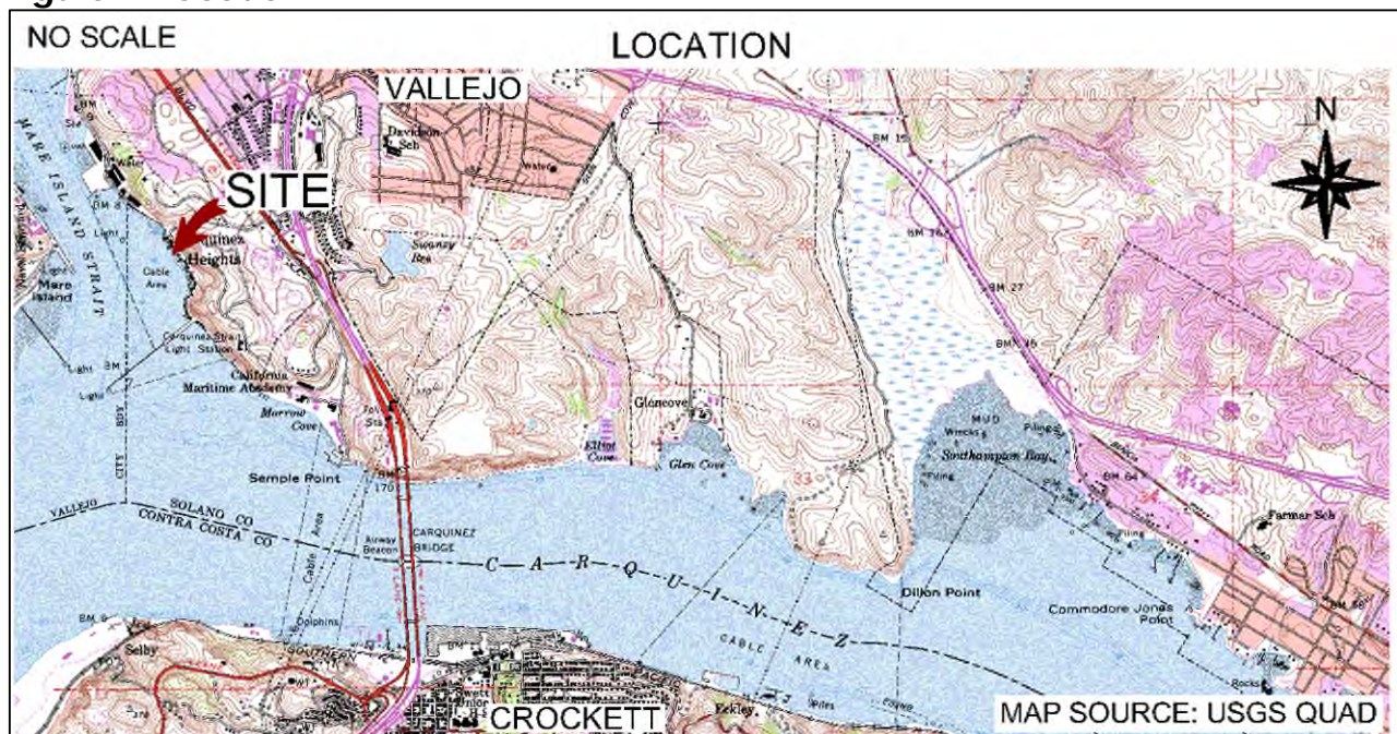
Figure 1. Location

Sovereign land in Mare Island Strait, adjacent to 10 Sandy Beach Road, Vallejo, Solano County (as shown in Figure 1).