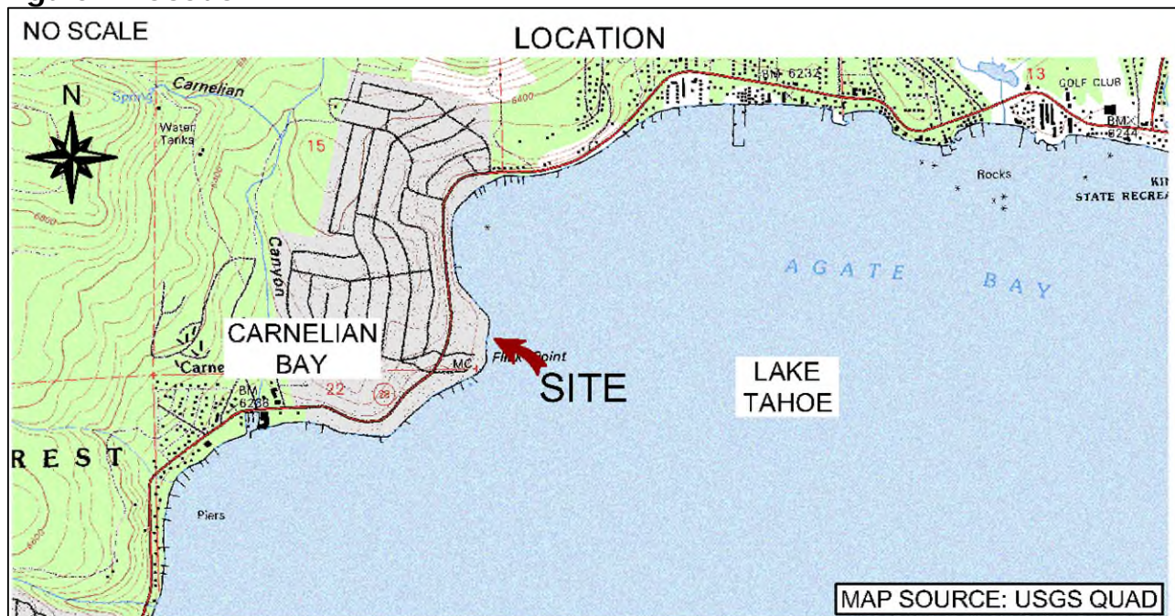
Figure 1. Location

Sovereign Land located in Lake Tahoe, adjacent to 5550 North Lake Boulevard, near Carnelian Bay, Placer County (as shown in Figure 1).