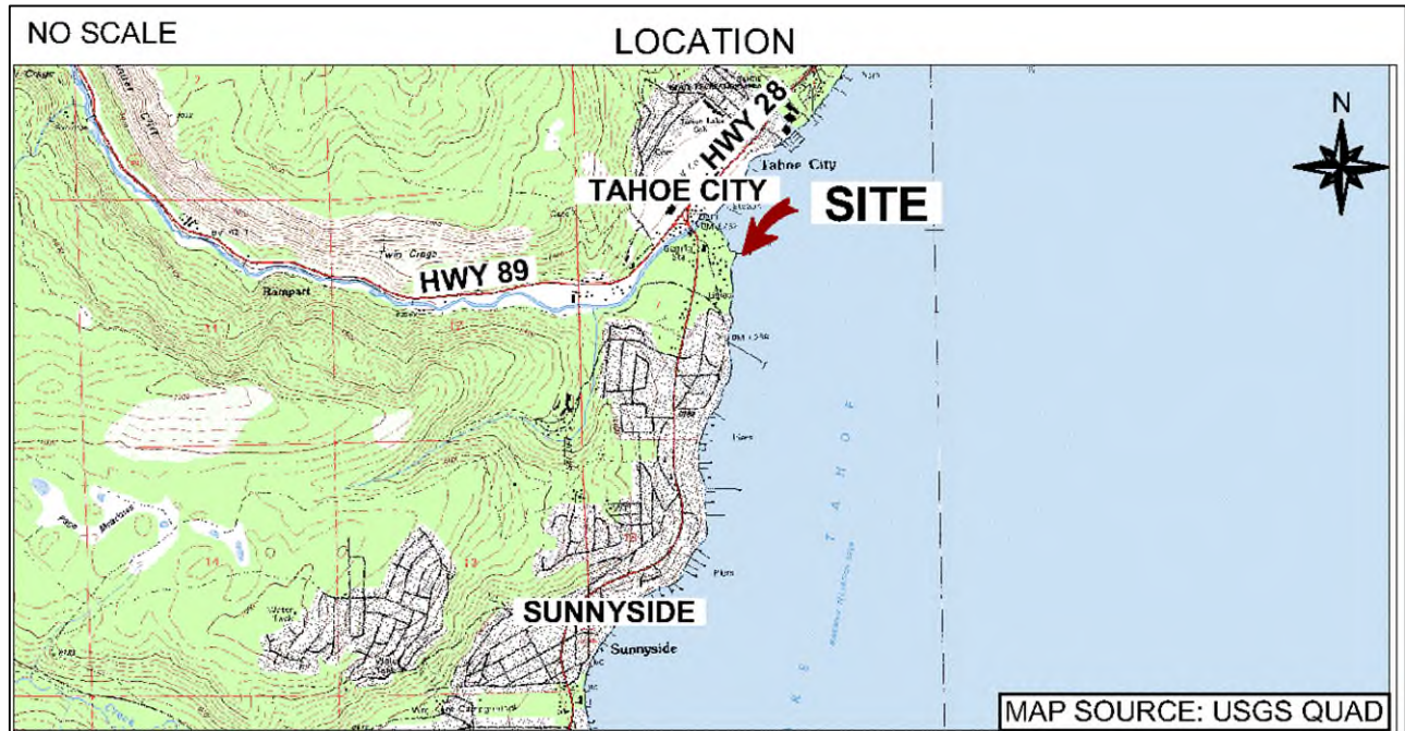
Figure 1. Location

Sovereign land in Lake Tahoe, adjacent to 180 West Lake Boulevard, near Tahoe City, Placer County (as shown in Figure 1).