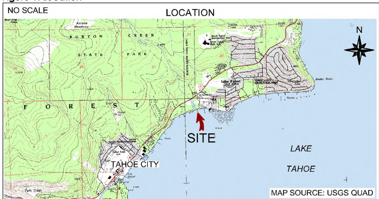
Figure 1. Location

Sovereign land in Lake Tahoe, adjacent to 2330 North Lake Boulevard, near Tahoe City, Placer County (as shown in Figure 1).