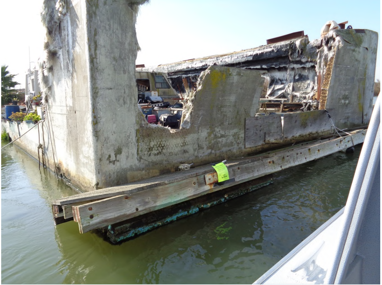
The burned remains of a LASH barge, with derelict RV.