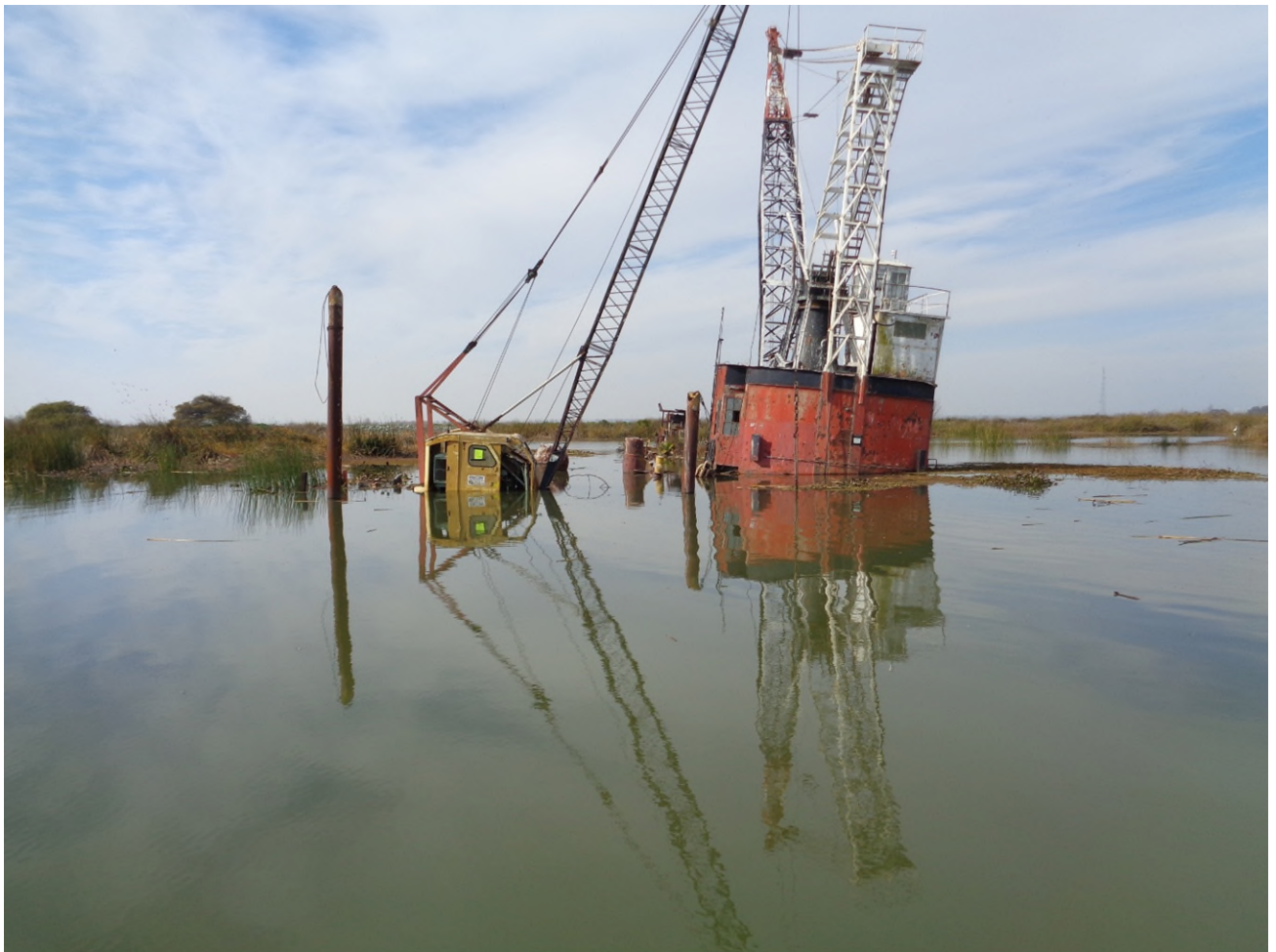
Peanut on the left; BD-245 on the right. The sunk barge is to the right of BD-245 .