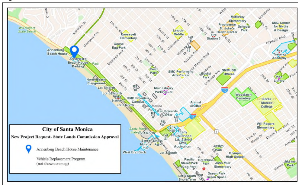
Figure 1. Location

Granted sovereign tide and submerged lands located in the city of Santa Monica, County of Los Angeles (as shown in Figure 1).