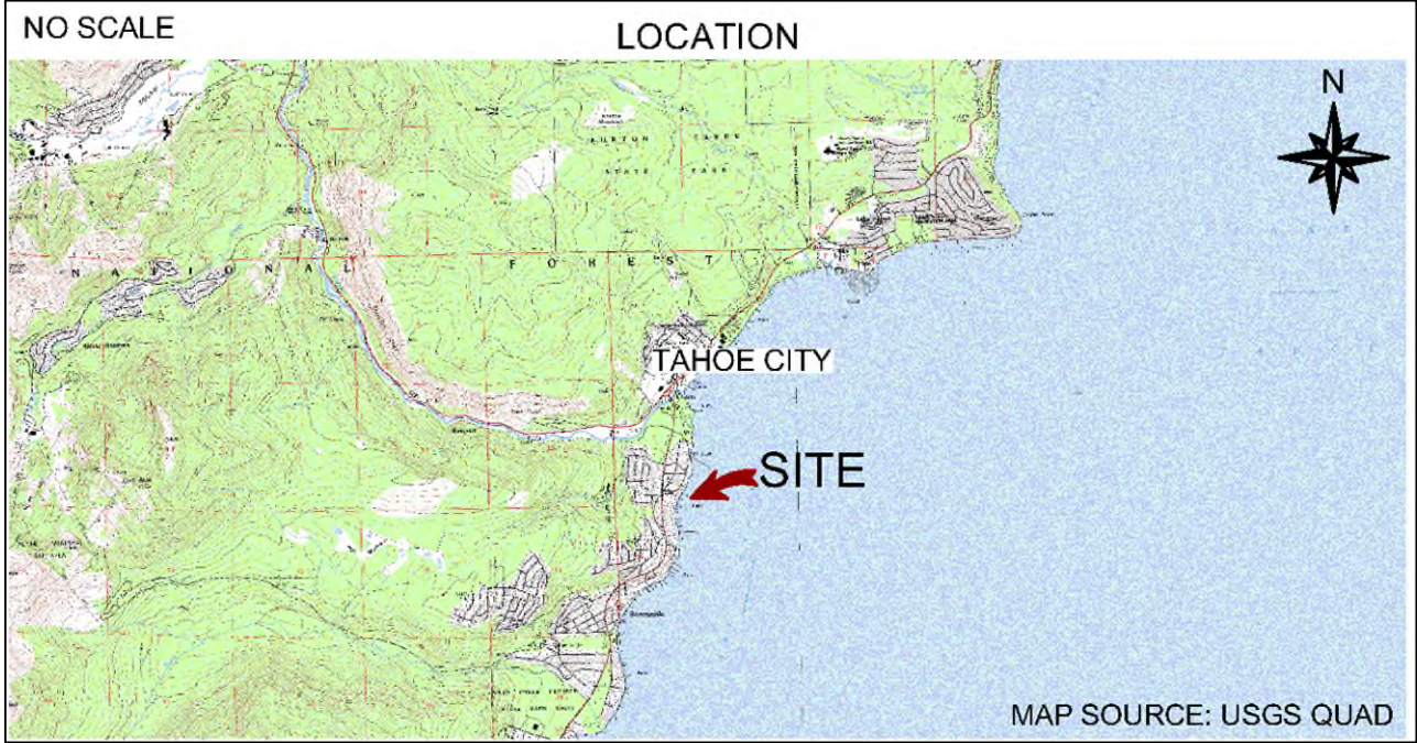
Figure 1. Location

Sovereign land in Lake Tahoe, adjacent to 672 Olympic Drive, Tahoe City, Placer County (as shown in Figure 1).