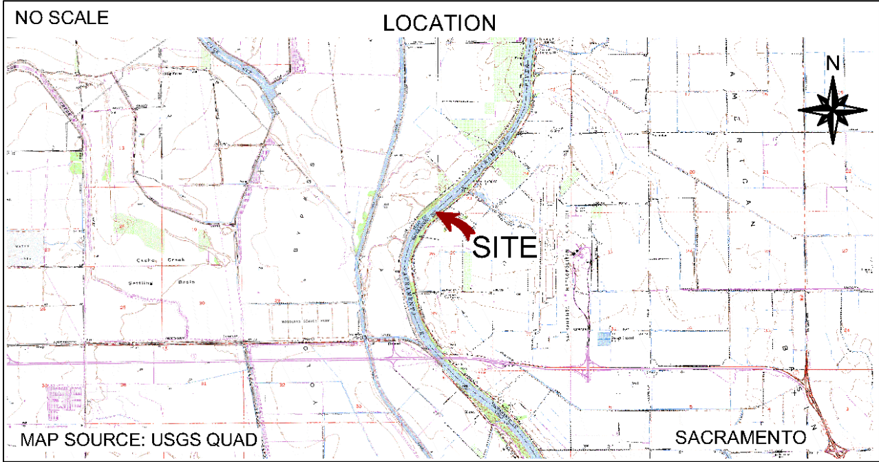
Figure 1. Location

Sovereign land located in the Sacramento River, adjacent to 7095 Garden Highway, Sacramento, Sacramento County (as shown in Figure 1).