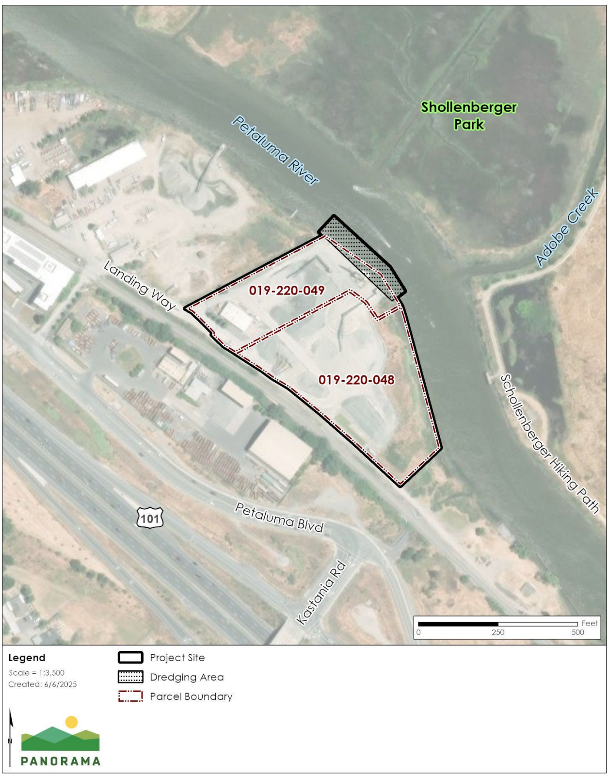
Figure ES-2 Dredging Vicinity