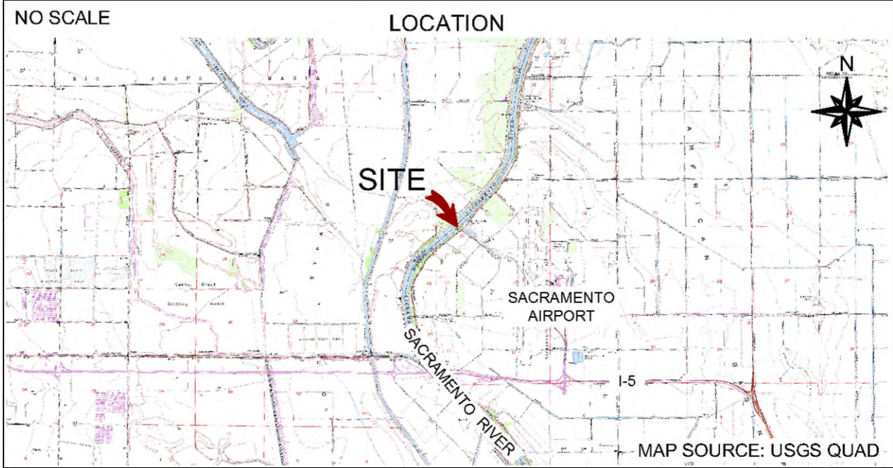
Figure 1. Location