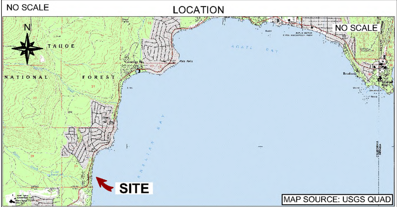
Figure 1. Location

Sovereign Land in Lake Tahoe, adjacent to 3700 North Lake Boulevard, Carnelian Bay, Placer County (as shown in Figure 1).