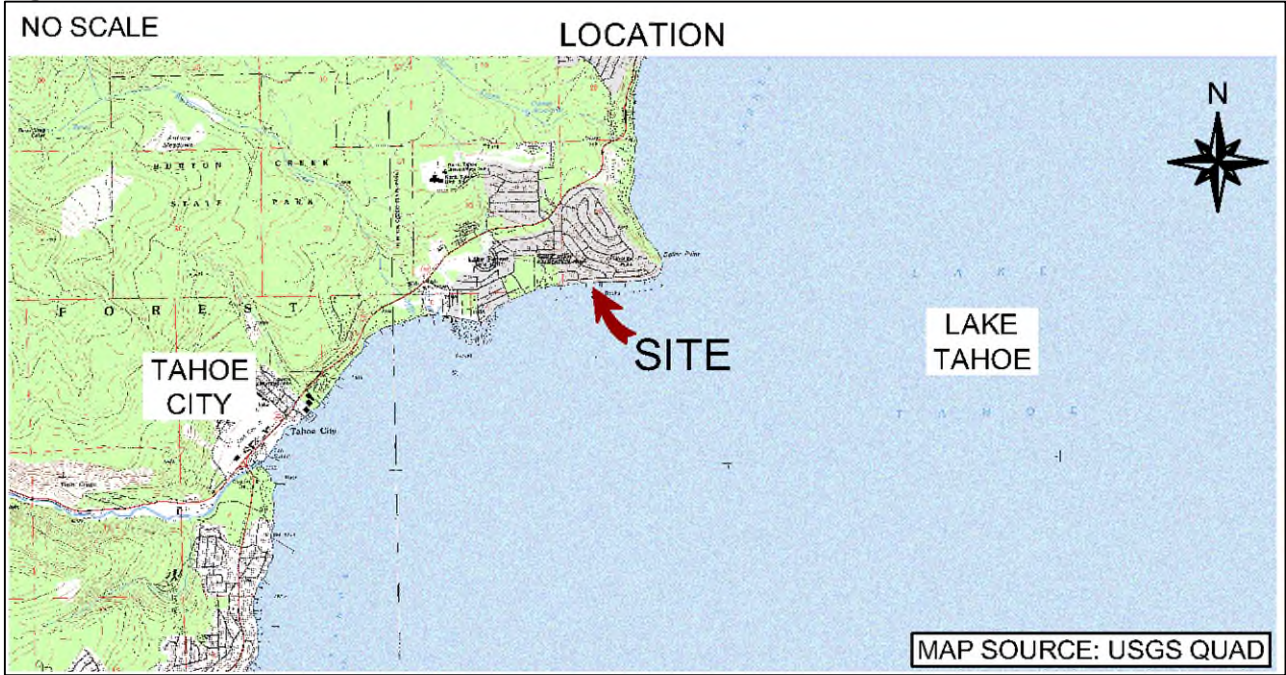
Figure 1. Location

Sovereign land in Lake Tahoe, adjacent to 3240 Edgewater Drive, near Tahoe City, Placer County (as shown in Figure 1).