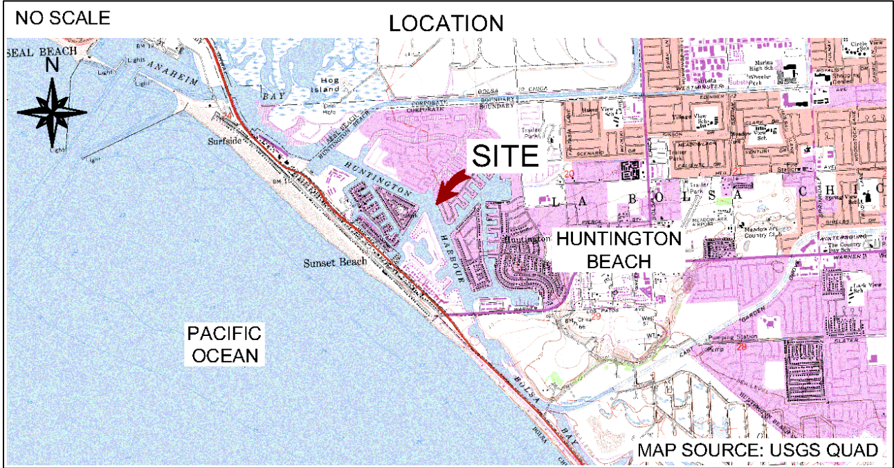
Figure 1. Location

Sovereign land in the Main Channel of Huntington Harbour, adjacent to 16611 Carousel Lane, Huntington Beach, Orange County (as shown in Figure 1).