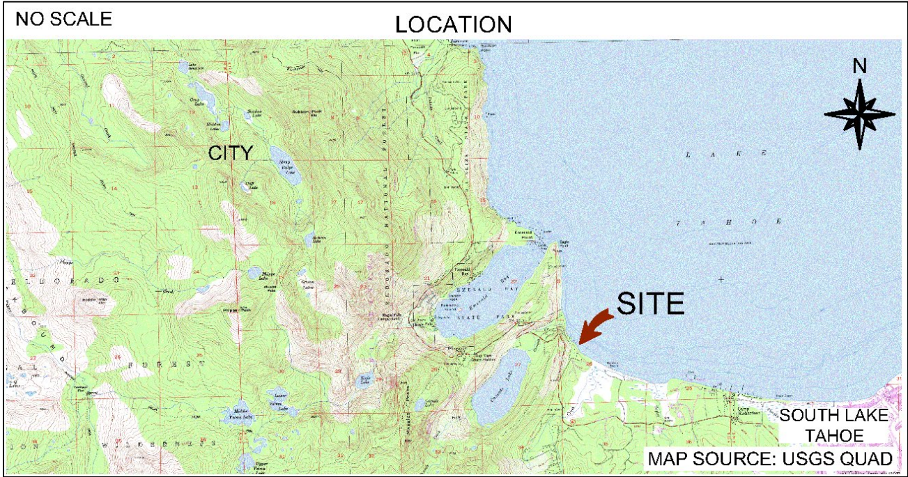
Figure 1. Location

Sovereign land located in Lake Tahoe, adjacent to 2247 Cascade Road, South Lake Tahoe, El Dorado County (as shown in Figure 1).