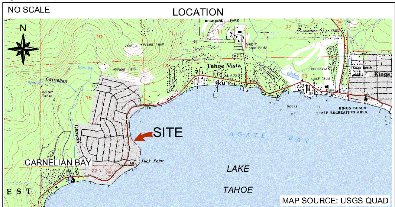
Figure 1. Location

Sovereign land located in Lake Tahoe, adjacent to 5660 North Lake Boulevard, near Carnelian Bay, Placer County (as shown in Figure 1).