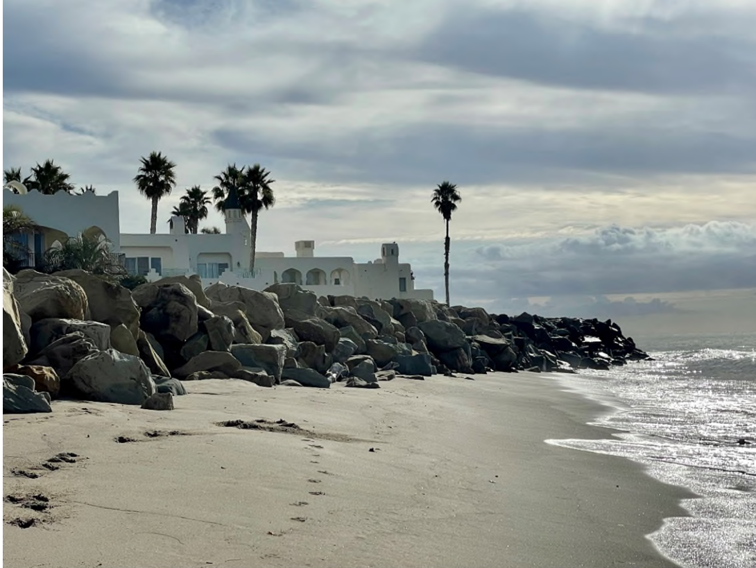
Figure 6: A revetment, used to protect private residential homes in Carpinteria, blocks lateral beach access between Santa Claus Beach and Sandyland Beach. Sandyland Beach cannot be accessed by the public during medium and high tides.

Hard armoring can also impair environmental preservation and restoration efforts by reducing beach habitats and significantly affecting species richness (the number of different species in an area) and abundance (the number of individuals of the same species). Compared to unarmored beaches, armored beaches in Santa Barbara County were found to have 50 to 67 percent lower species richness and 75 to 91 percent lower species abundance compared to adjacent unarmored beaches (Dugan, Hubbard, Rodil, Revell, & Schroeter, 2008).