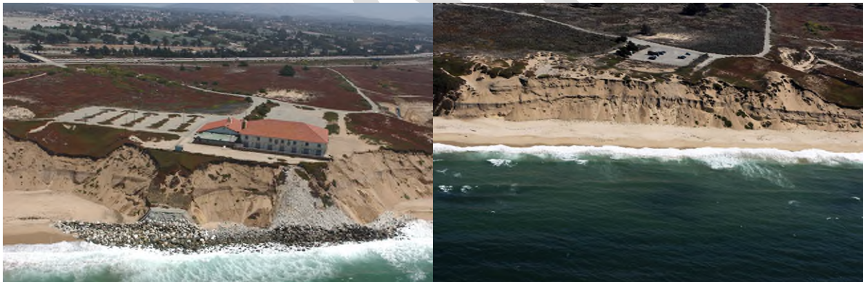
Figure 12: Before (left) and after (right) the removal of Stilwell Hall and a rock revetment at Fort Ord.