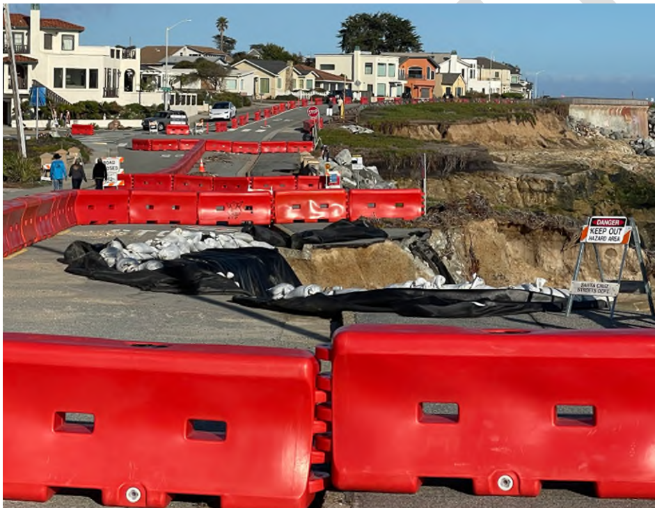
Figure 2: Major erosion from a large storm caused West Cliff Drive in Santa Cruz to close to traffic.

Waterways and the coast are major economic drivers in the state, generating billions of dollars in local and state tax revenues, and supporting hundreds of thousands of direct jobs and millions of associated employment opportunities. The direct ocean economy alone employed nearly 600,000 people in 2019, with 445,000 of those jobs coming from the tourism and recreation industry (National Ocean Economics Program, 2022). The direct ocean economy, which is supported by much of the infrastructure located on state lands, contributed over $51 billion to the state's Gross Domestic Product in 2019. These critical jobs and economic assets are at risk from flooding and other climate change impacts that will reduce the area of shorelines and damage or destroy critical infrastructure 26 , private property, and public amenities.