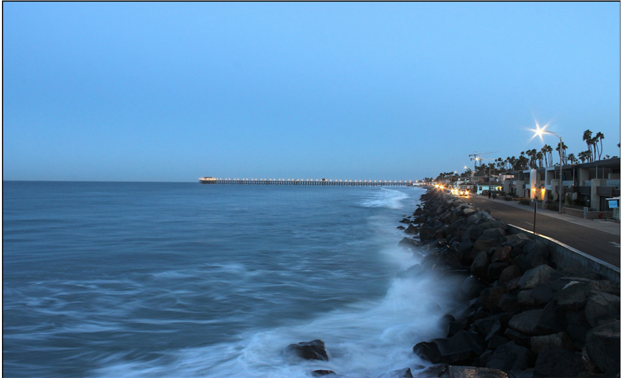
Figure 4: A rock revetment protects residences in Oceanside where the beach has eroded.

Hard armoring structures are engineered structures that are constructed parallel to the coastline and provide a solid barrier between the land and sea to block or minimize the energy of tides and waves that interact with the land. They are commonly used to reduce the threats posed by coastal hazards, such as flooding, erosion, and damages from wave energy.