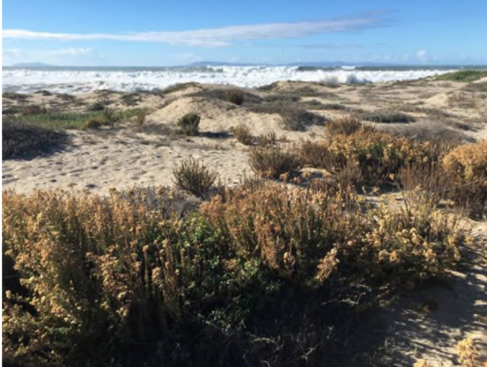
Figure 7: Sand dunes and cobble berms at Surfers Point in Ventura provide protection during a large swell in 2015.