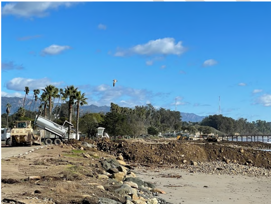
Figure 8: Beach nourishment at Goleta Beach Park, 2023.

Beach nourishment can temporarily protect against coastal hazards by widening beaches and providing a larger buffer between upland development and the effects of erosion and storm damages (Figure 8). By making beaches wider and gradually sloped, beach nourishment reduces wave run-up and potential flooding and erosion of upland areas. Beach nourishment also addresses sediment deficits, which can be an underlying cause of erosion, by increasing the quantity of beach sediment in the coastal region (Zhu, Linham, & Nicholls, 2010). Sand retention structures, like groins, can complement beach nourishment by retaining the added beach sediment and decreasing the frequency of future renourishment projects.