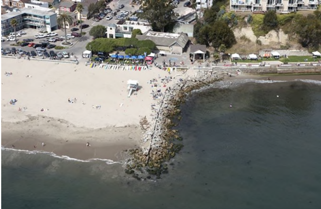
Figure 9: Groin at Capitola Beach.