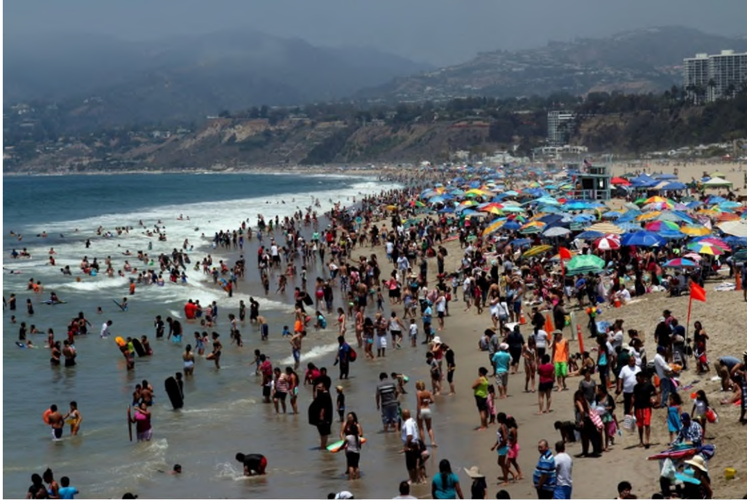
Figure 1: A large crowd of people celebrating a July 4th holiday at Santa Monica State Beach.