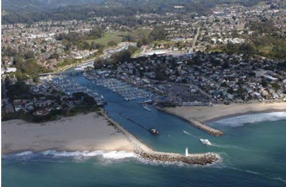
Figure 10: The jetties at the Santa Cruz Harbor interrupt the flow of sediment, creating a wide beach immediately upcoast of the harbor but depleting downcoast beaches.