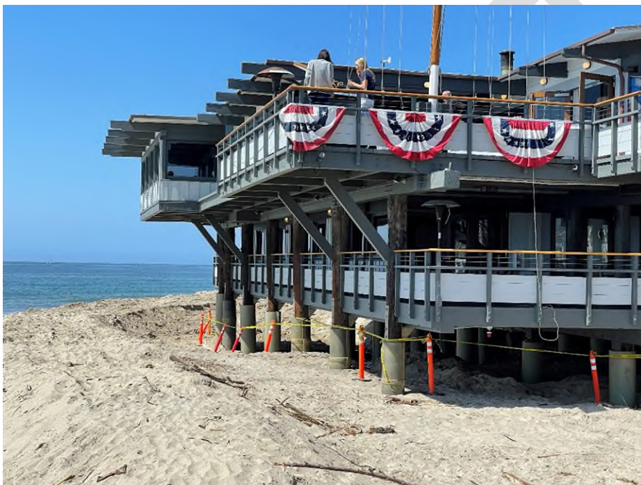
Figure 11: The Santa Barbara Yacht Club is elevated on pilings to accommodate some wave run-up and flooding. However, it still experienced structural damage from large waves in January 2023.

Accommodation strategies use methods that modify existing structures or design new structures to withstand some degree of inundation, wave impacts, or rising sea levels. These strategies can allow structures to remain in hazard-prone areas but reduce their vulnerabilities. This may include elevating buildings with pilings or stilts, flood-proofing structures, using stronger and corrosion-resistant materials, or improving the drainage of floodwaters. At ports, marinas, and harbors, this could include elevating docks, raising guide piles, and flood-proofing any at-risk asset. Flood-proofing often includes the use of 'flood-resistant' materials, like brick or stone, that can withstand direct or prolonged floodwaters without significant damage. After hard armoring, accommodation strategies are the most widely used adaptation strategies to-date (Glavovic, et al., 2022).