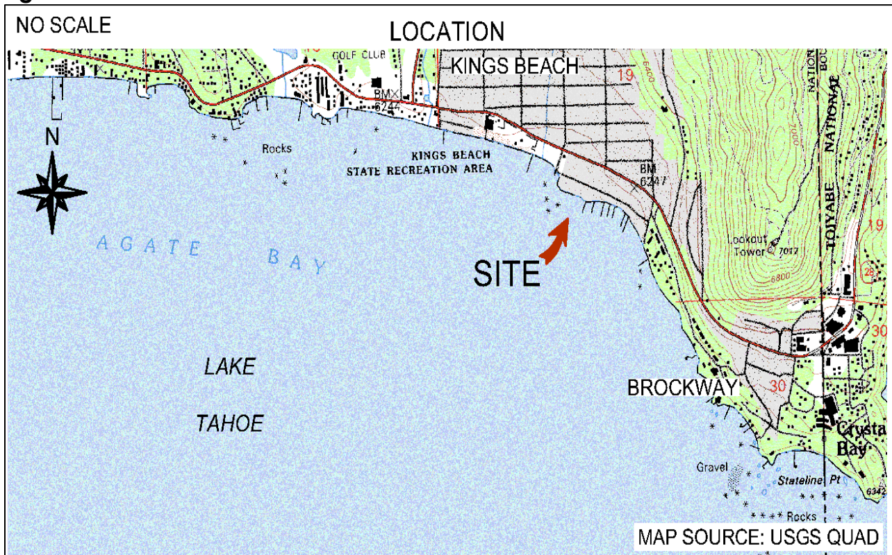
Figure 1. Location

Sovereign land located in Lake Tahoe, adjacent to 8656 Brockway Vista Avenue, near Kings Beach, Placer County (as shown in Figure 1).