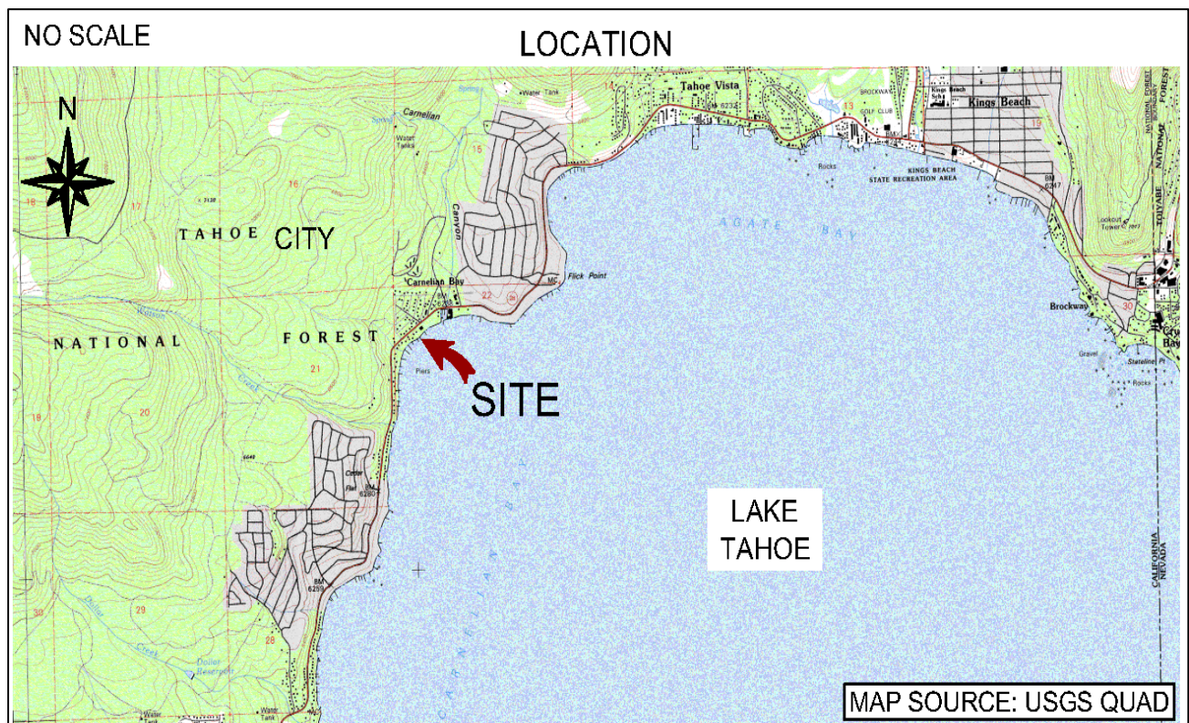
Figure 1. Location

Sovereign land in Lake Tahoe, adjacent to 4990 North Lake Boulevard, near Carnelian Bay, Placer County (as shown in Figure 1).