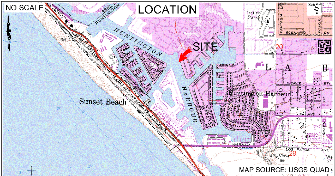
Figure 1. Location

Sovereign land in the Main Channel of Huntington Harbour, adjacent to 16591 Carousel Lane, Huntington Beach, Orange County (as shown in Figure 1).