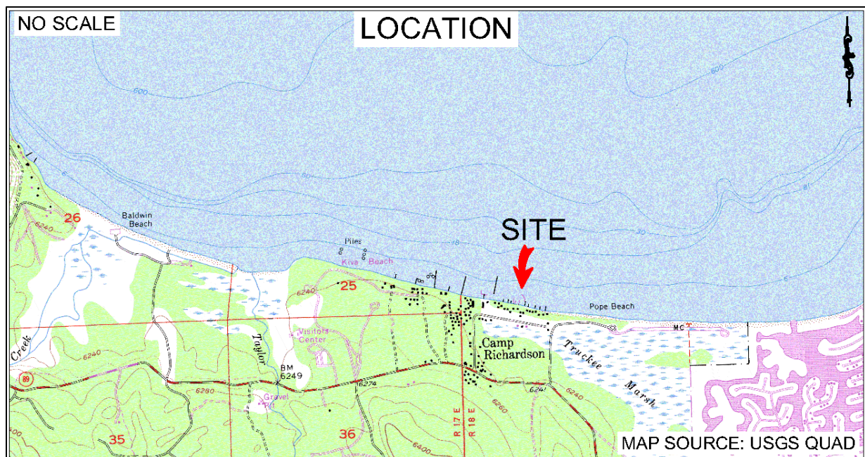
Figure 1. Location

Sovereign land in Lake Tahoe, adjacent to 3075 Jameson Beach Road, near South Lake Tahoe, El Dorado County (as shown in Figure 1).