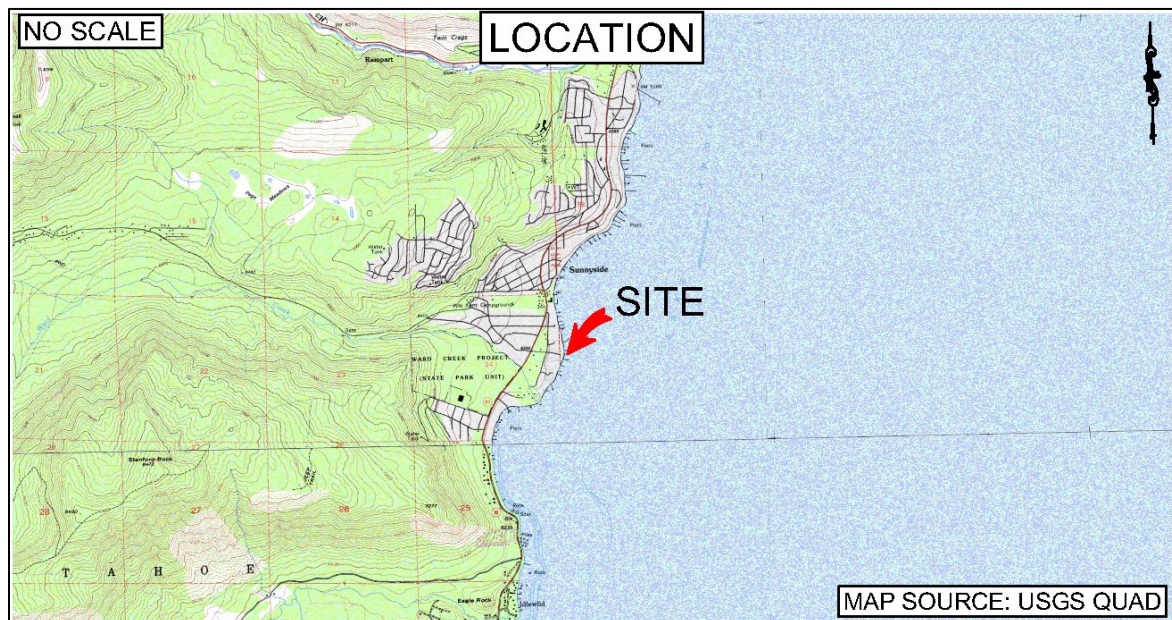
Figure 1. Location

Sovereign land in Lake Tahoe, adjacent to 2220 Sunnyside Lane, near Tahoe City, Placer County (as shown in Figure 1).