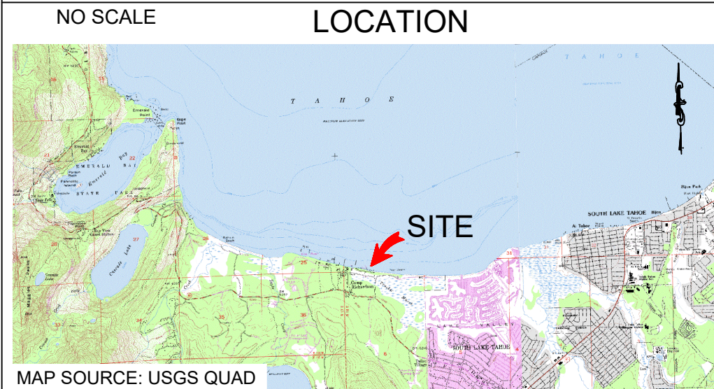
EXHIBIT B LEASE 4147 3099 JAMESON BEACH ROAD, LLC APN 032-120-025 GENERAL LEASE - RECREATIONAL USE EL DORADO COUNTY