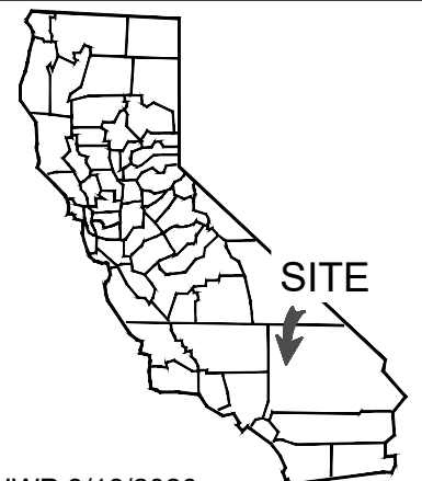
EXHIBIT A SA 5772 BARSTOW SPANISH TRAIL, LLC SCHOOL LANDS - SALE SAN BERNARDINO COUNTY

THIS EXHIBIT IS SOLELY FOR PURPOSES OF GENERALLY DEFINING THE SALE PROPOERTY, IS BASED ON UNVERIFIED INFORMATION PROVIDED BY THE APPLICANT OR OTHER PARTIES AND IS NOT INTENDED TO BE, NOR SHALL IT BE CONSTRUED AS, A WAIVER OR LIMITATION OF ANY STATE INTEREST IN THE SUBJECT OR ANY OTHER PROPERTY.