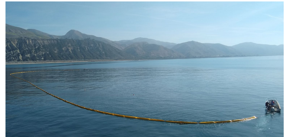
Images of Rincon Island boom drills and causeway repairs helping ensure safe operations