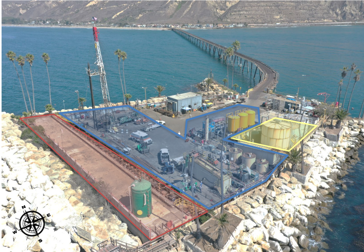
Well P&A Operations - September 2020