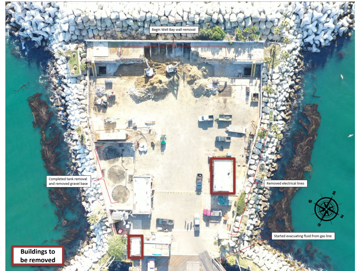
Image of Rincon Island surface decommission work to prepare island for Caretaker Status captured March 19, 2021