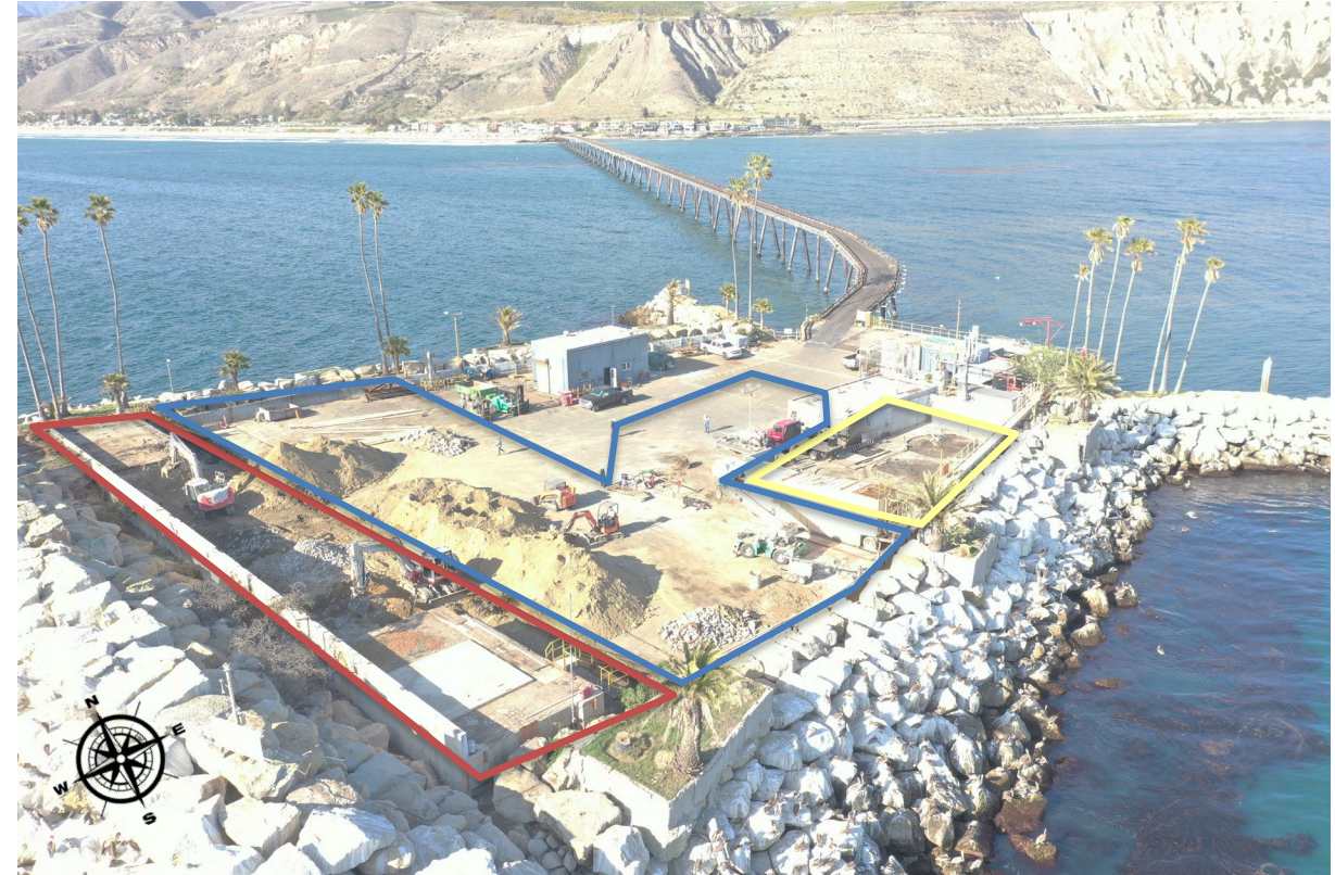
Caretaker Preparation - March 2021