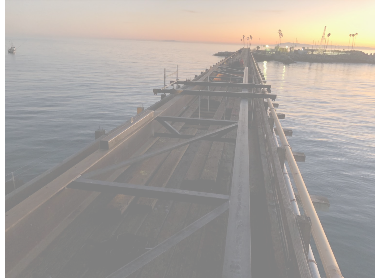
Image of Rincon Island and causeway strongback installation at sunset