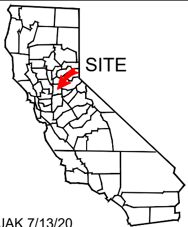
Exhibit A PRC 7429 RANCHO MURIETA COMMUNITY SERVICES DIST. GENERAL LEASE - RIGHT-OF-WAY USE SACRAMENTO COUNTY